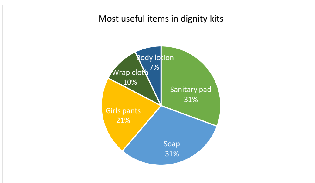
Figure 2: Most useful items in dignity kit

The items in the dignity kit and their importance were ranked as follows: 30% reported sanitary pads as the most crucial during menstruation; 30% mentioned soap; and 22% reported that the panties are the most important item during their periods. Additionally, the body lotion and the wrap cloth ( kitenge ) were reported as useful items.